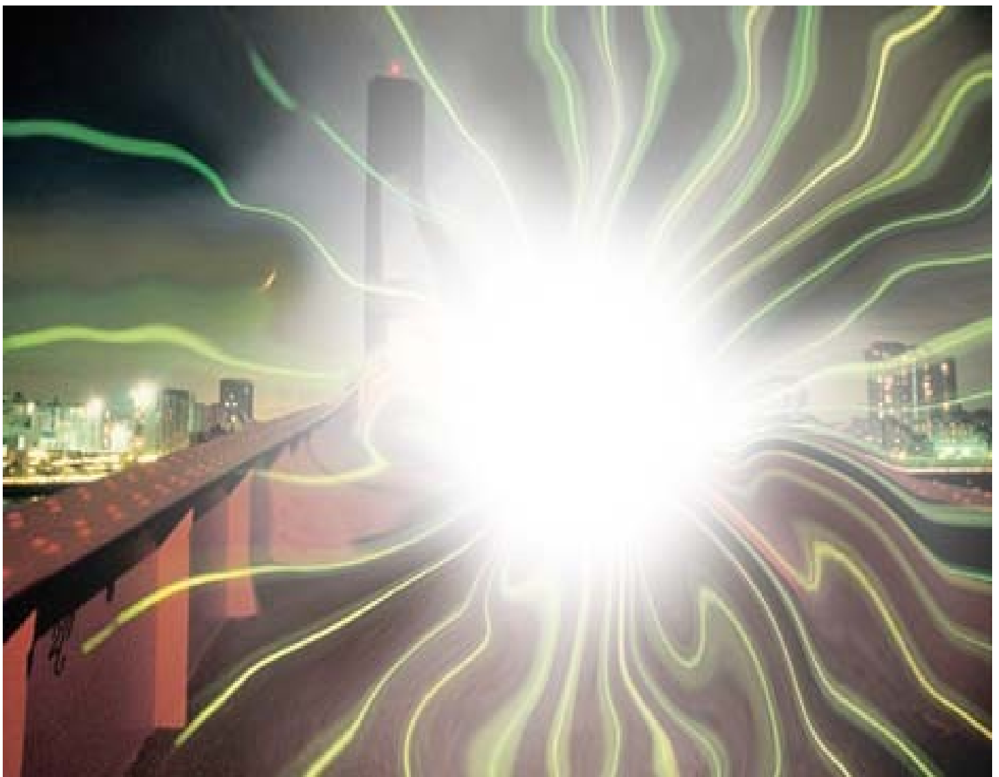
Fig. 2 Projection Bombing

Light-Designers, Light-Architects, Light-Engineers und all sorts of Light-Artists 'dance the night away'. High-Intensity – LED – (HI-LED) spots, embedded in pavements, ramps and streets emit light into the cosmos. Futile. The beams are targeted at the stars. The desired promotional effects equal zero. Those inverted, amiss floodlights blind and irritate pedestrians, cyclists, bikers and other traffic participants as well. Luminous advertising of all kinds, 'dynamic', flashing and blinking, inapt street lighting, imperfect accent- and effect-lighting, food lighting, bright skyscraper-illumination, 'decorative'-bridge-lightings, lighting installations for 'mega-events', night-skiing-slopes, sky-beamers, laser shows, blazing jumbo fireworks in increasing numbers, chintzy illumination of waterfalls – in candy colors –, light graffiti (in the streets, in nature), projection bombing (Fig. 2) 'madness' (modern hooligan 'fun'), systematic light- 'embellishments' ('Behübschung') for whole towns – inexcusable waste of public money.