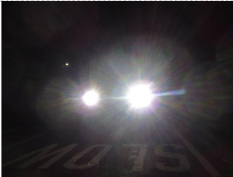
Oncoming vehicle with LED headlights on low beam traversing humps in Botwnnog

As darker nights approach, I am taking issue with you about the speed humps installed by the Council in Botwnnog which are illegally blinding drivers and putting lives at risk.