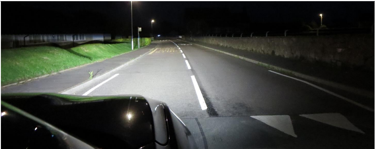
A driver's view from vehicle with LED headlights (correctly set at 1.2% dip) on low beam traversing humps.

Note how the beam illuminates the Doctors Surgery on the left-hand side, the bus stop sign and the right-hand wall above eye height and also penetrates 170metres down the road illuminating the chevrons at the exit bend from Botwnnog thus blinding oncoming drivers.