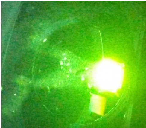
A LED headlight viewed through single DIN grade 10 welding mask filter; Welders use single DIN filters graded 8 - 14

In the first video, Professor Veto shows how a LED headlight penetrates two layers of DIN shade 10 arc welding mask filters. Welders know that a flash of a few milliseconds can cause eye-damage.